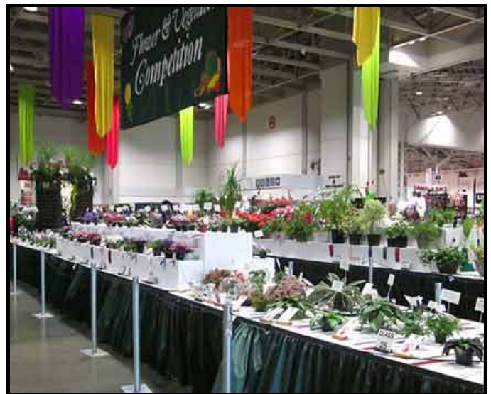
One of the Display Tables

Once we arrive we each get going to get our own plants entered, doing any last minute grooming needed, putting in the flags, and getting them into their classes. As we do for our local clubs shows, we do all the grooming at home because of the short amount of time. Only last minute touch ups. Once we get all our plants entered we stage the show. This is to check all entries are in their correct classes, splitting any classes if required, and to space them out to ensure they're nicely presented.