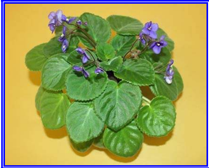
Best in Show Saintpaulia sp. grotei 'Silvert' Arthur Jenkins

1 st Saintpaulia sp. grotei 'Silvert' BIS Arthur Jenkins