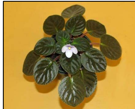
S. sp. diplotricha 'Parker'