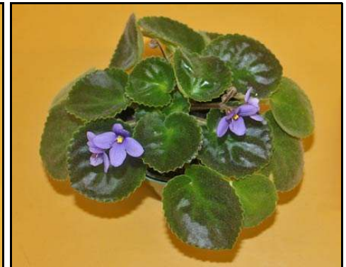
S. sp. diplotricha 'Uppsala'