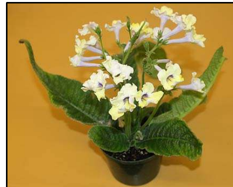
Streptocarpus hybrid with thick leaves and stems - Paul Lee