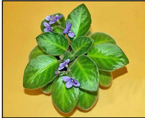
Saintpaulia sp. 'Sigi Falls'

Arthur Jenkins brought these four AV species to supplement our program.