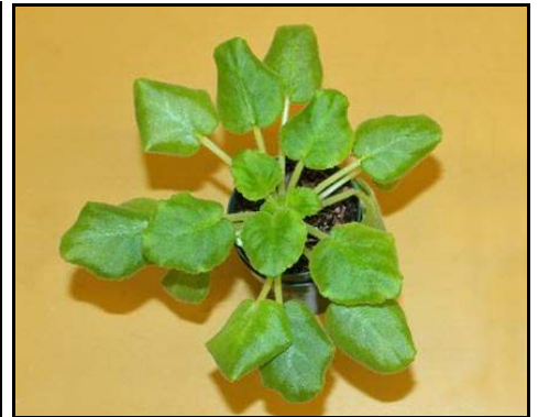
Saintpaulia sp. white ionantha